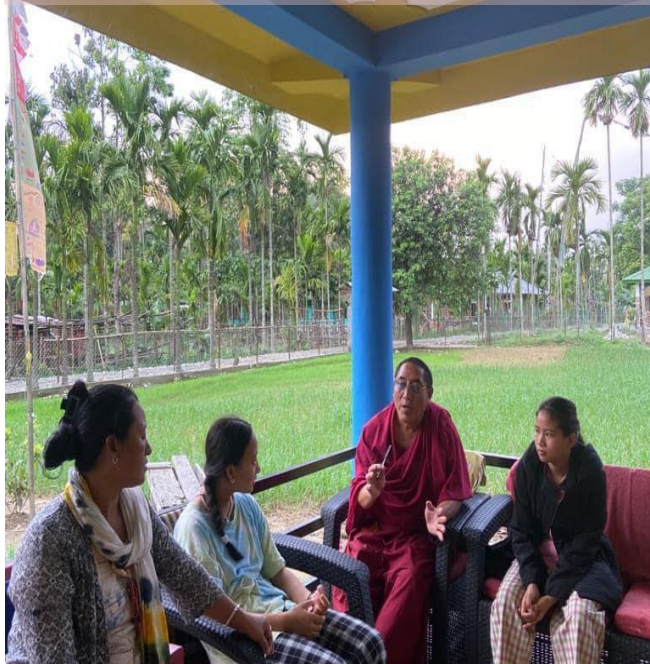
Teachers' Home visit program arranged by PTA